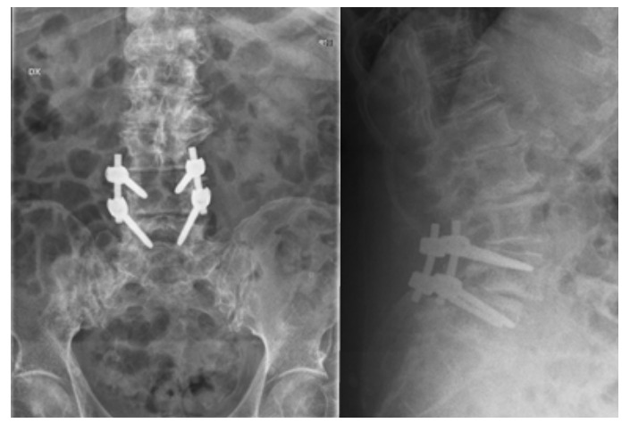
Figure 3: X-ray image in and in anterior-posterior (a) and lateral (a) position on the second postoperative day after onelevel L4/5 fusion surgery and laminectomy.

extubated in 15 minutes after the end of surgery. The patient awoke absolutely pain-free (NRS 0-1) and without nausea. She presented slightly confused in the first 20 minutes after the surgery but was able to communicate properly and convincingly controlling her airways.