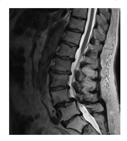
Figure 1: Magnetic resonance image in lateral position.

spondylolisthesis and L4-L5 stenosis as seen in figure 1.